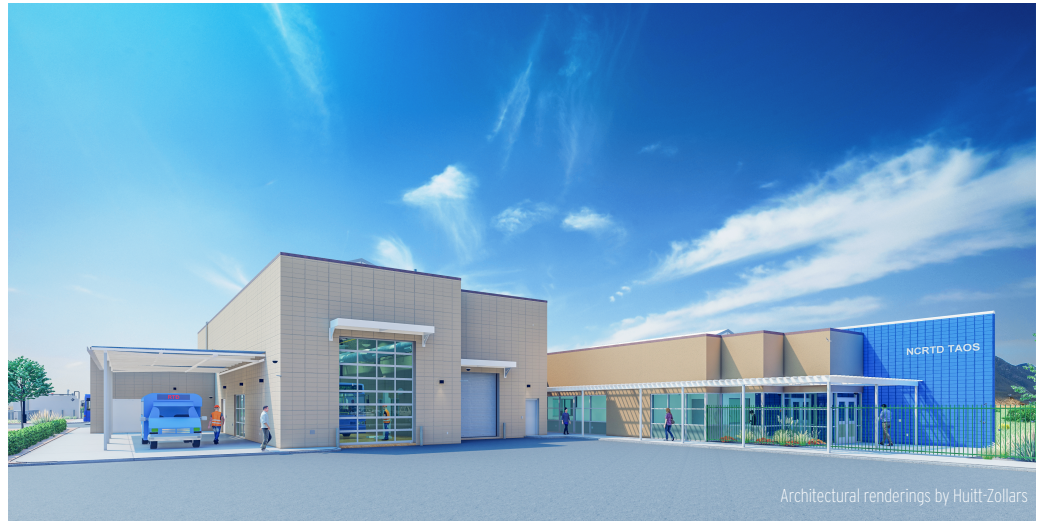
Architectural renderings by Huitt-Zollars