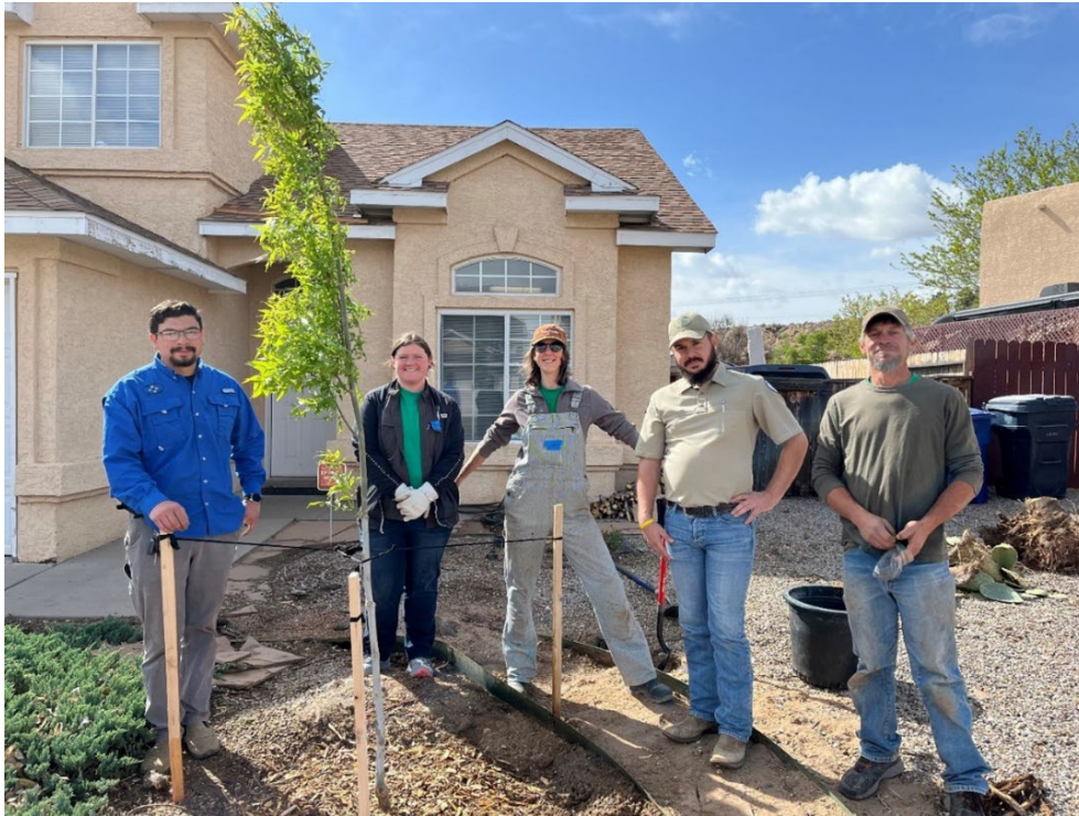
Forestry Division and Tree New Mexico partner for a tree planting in Socorro.

The Governor’s Arbor Month proclamation is available online here .