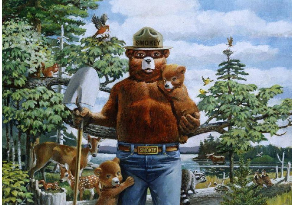
“Smokey Says – Prevent Wildfires,” 1993, Rudy Wendelin, 22”x28”