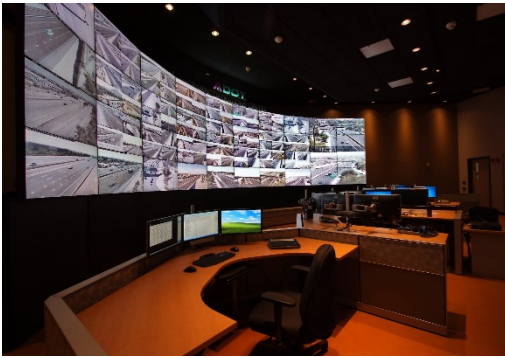
Figure 4. Traffic Operation Center (TOC).