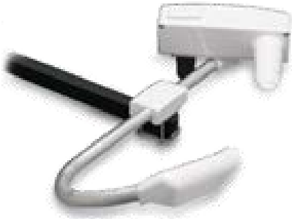
Figure 1. Spot detection visibility sensor.

*Note that all images in the Arizona DOT section were provided by R. Karimyand and their original source is unknown at this time.