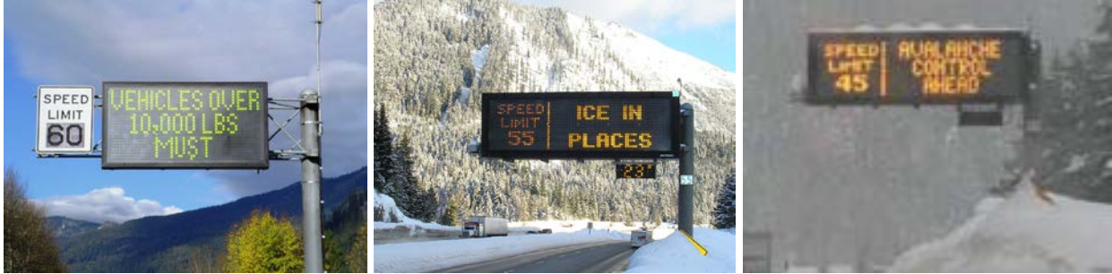
Figure 5. Examples of DMS board language and posted VSLs used by WSDOT.

Washington State DOT uses automatic VSL in urban areas for speed harmonization, and DMS boards to aid in traffic management.