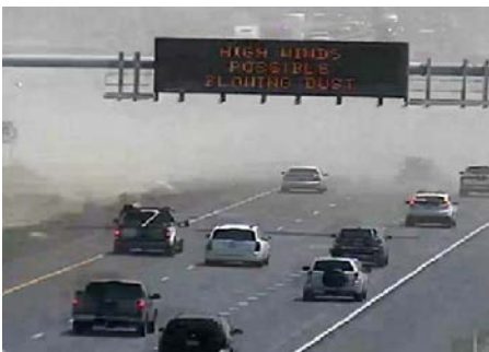
Figure 3. Dynamic message sign (DMS) used to provide messages to the traveling public.