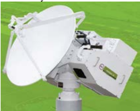
Figure 2. Long range radar weather detection sensor.